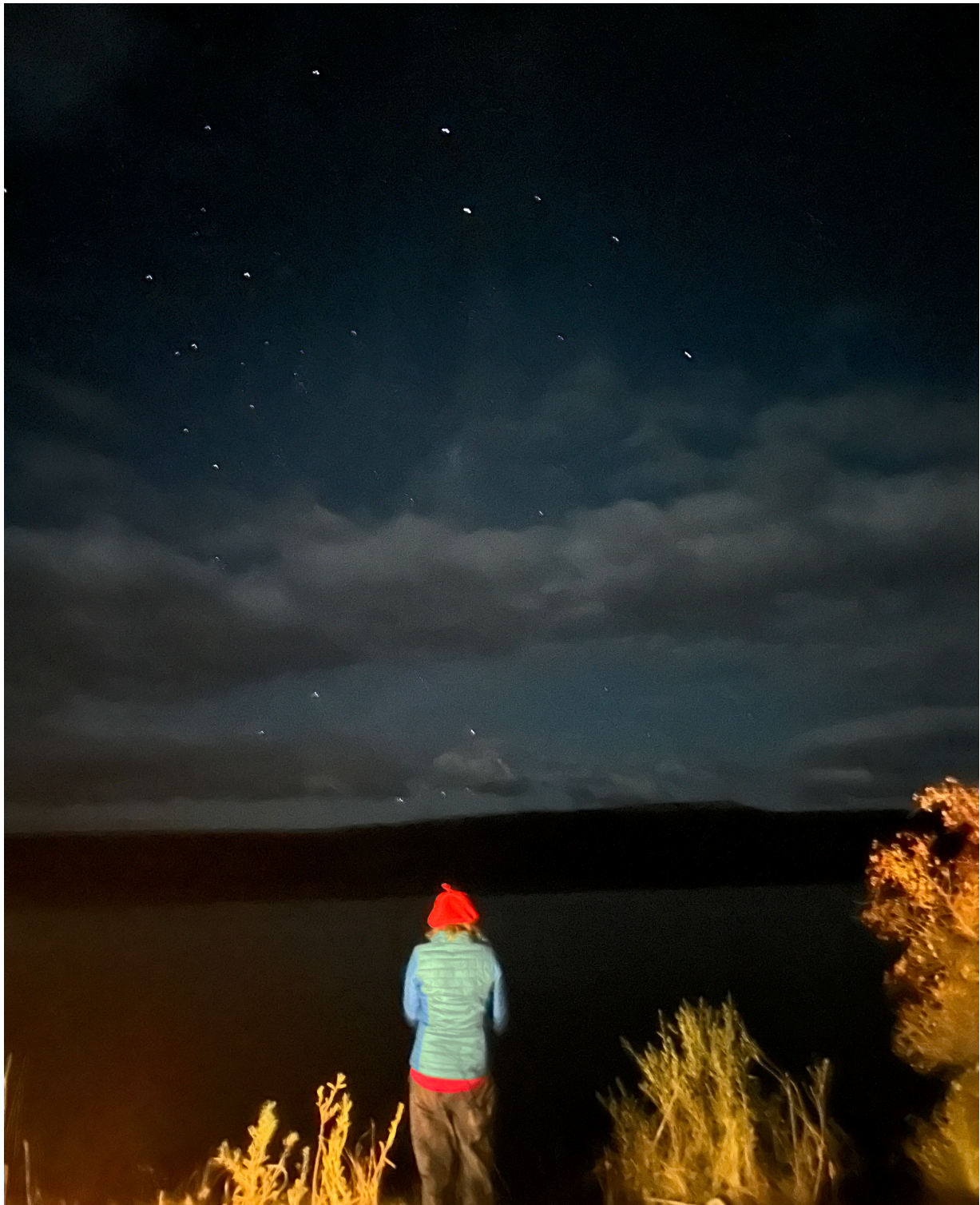
A starry night filled with hope in Patagonia.