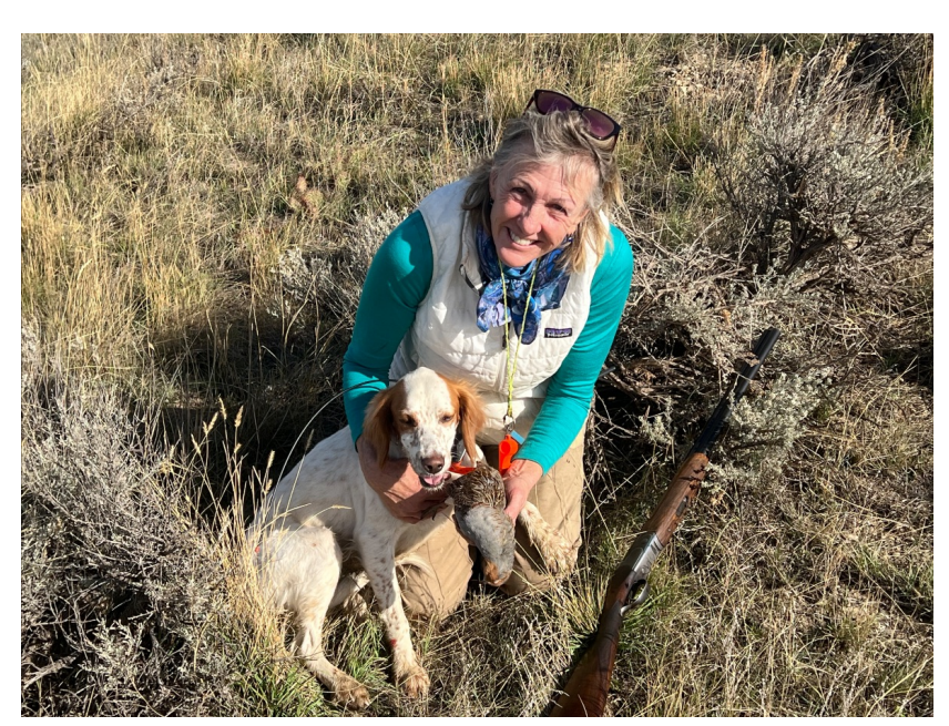
Yep. A big fun time with my Pixie-Girl in Montana. Hungarian Partridge and proud Pixie.