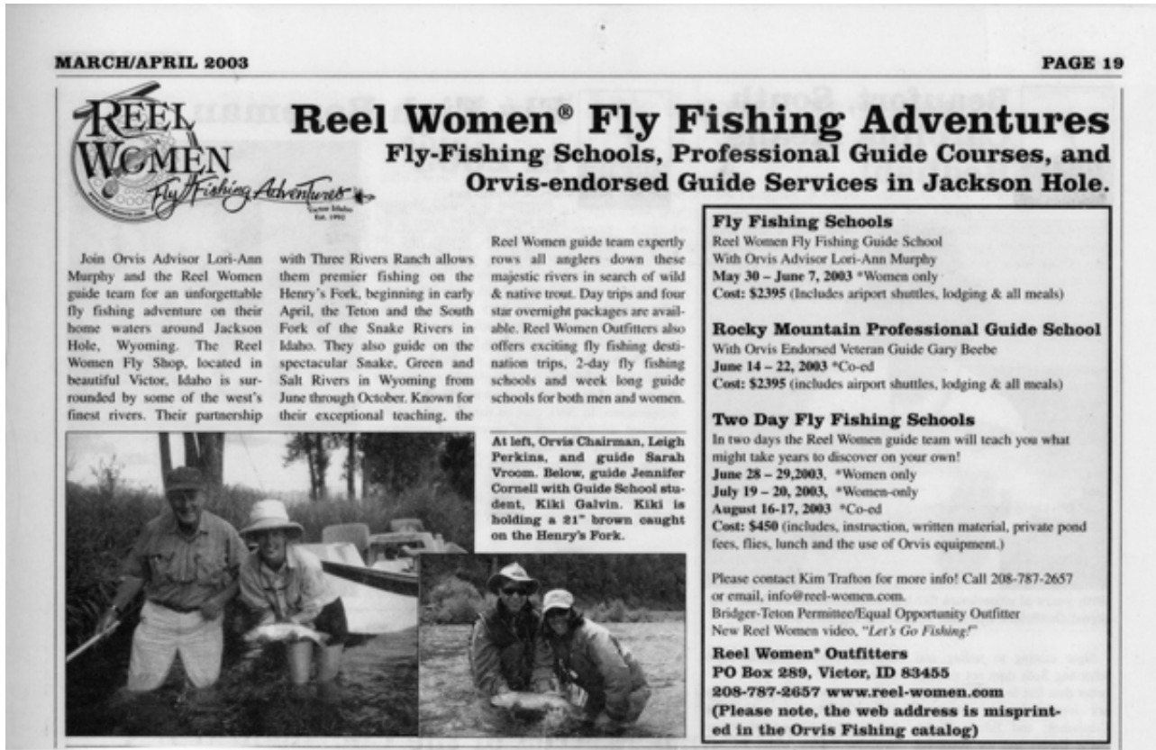
Below: Reel Women Fly Fishing Adventures in Orvis News, 2003