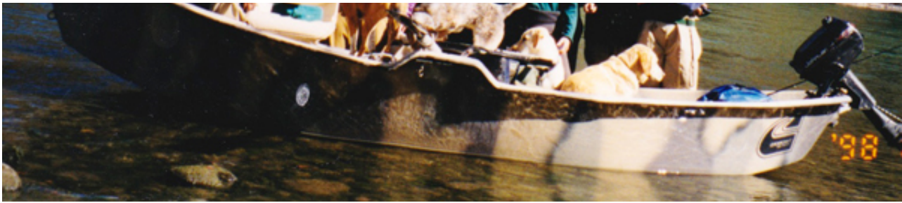
Above: Reel Women Fly Fishing Adventures Guides, 1998