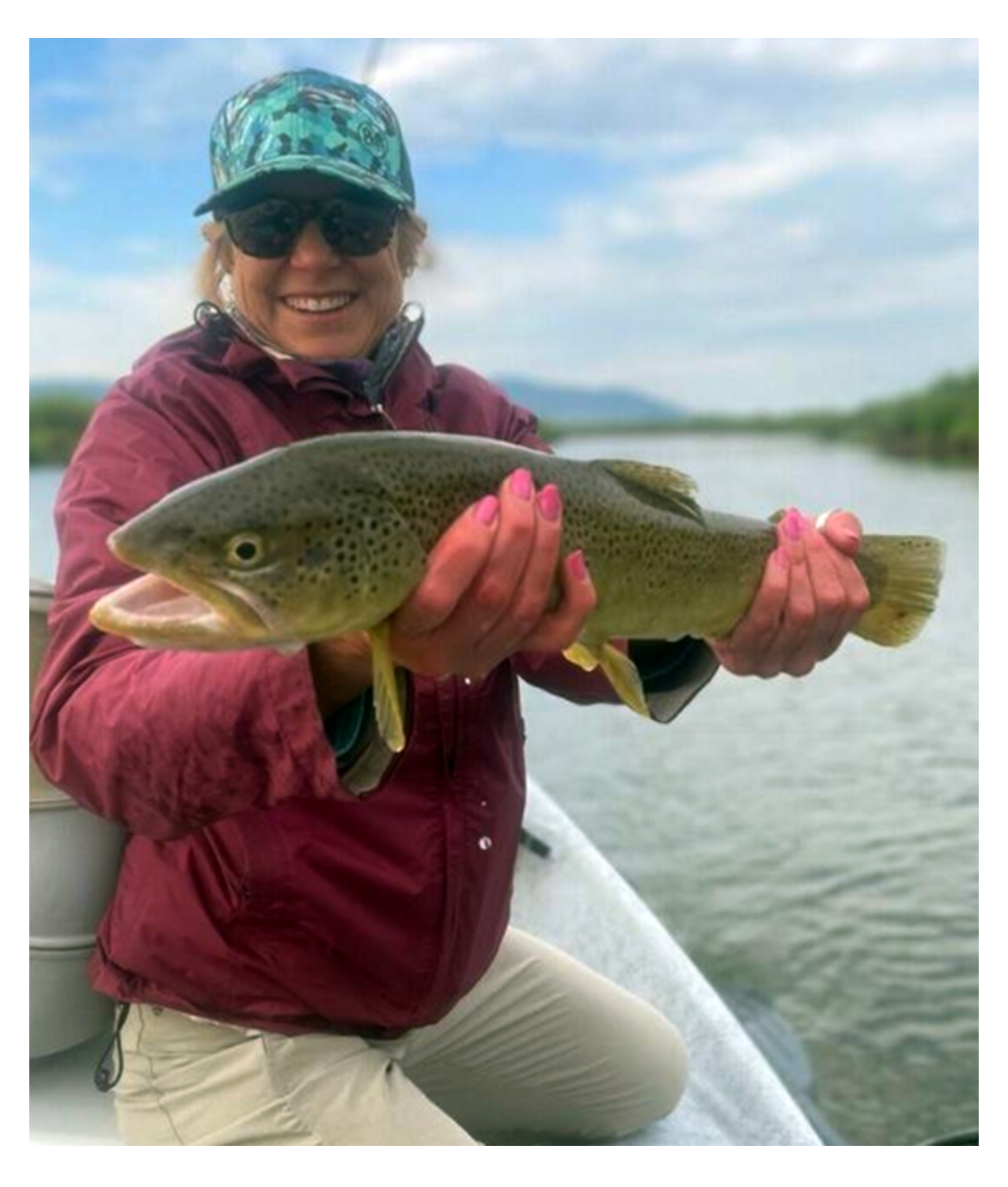
2nd Annual Fly Fishing Trip 2022