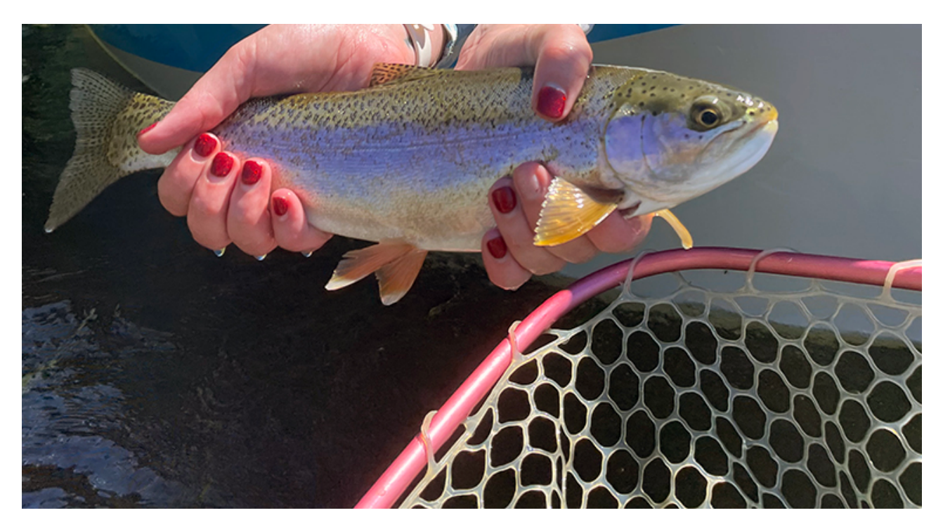
Heather catches a beautiful rainbow as Anni looks on during Reel Women Fly Fishing Adventures 2022 Guide School.