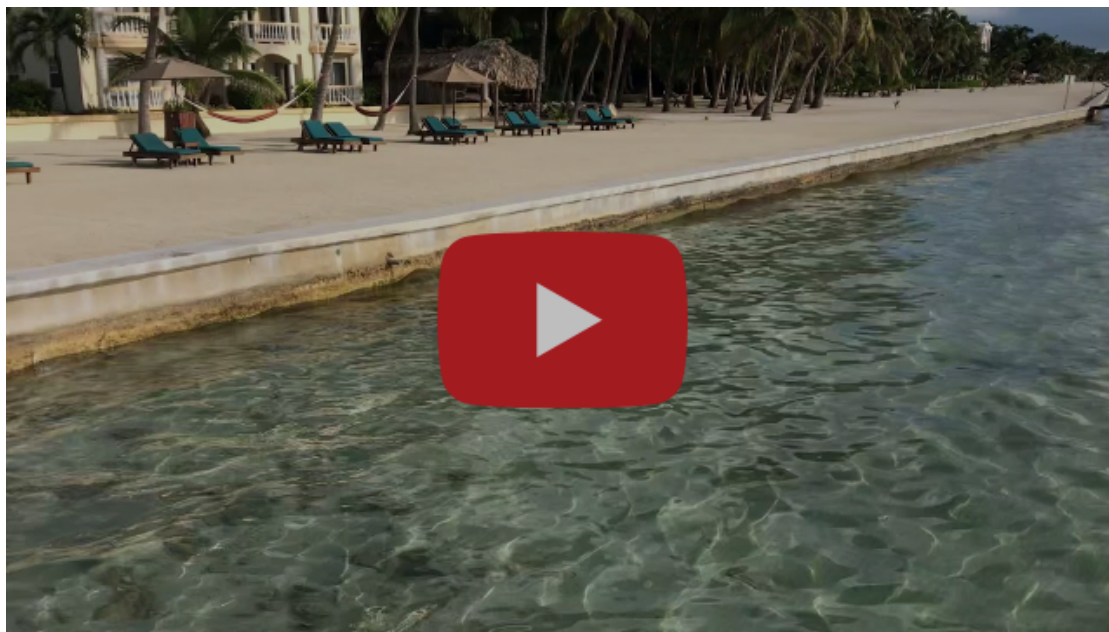
The Beach Walk!