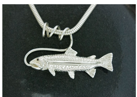
The Reel Women Store

Loving life for all it brings us. Check out the store to see many additional necklaces as well as shirts, buffs, stickers and more.